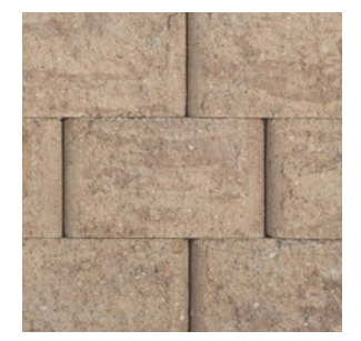
CHESAPEEAKE JAMES RIVER